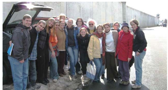
Outside facilitators and participants at Auburn Prison

Contact our AVP/NY office for more information at: 800-909-8920 or avpnys@aol.com